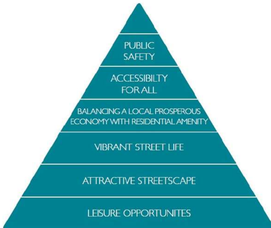
Figure 1: Representation of Factors to Consider in Footpath Trading.